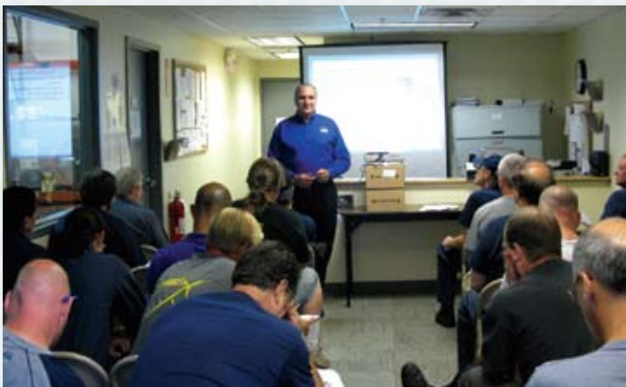
On Sept. 8, 2010, repair technicians attended an open house at the Braintree Motorist Assistance Center and received free training on On-Board Diagnostics Readiness Monitor Setting Techniques.